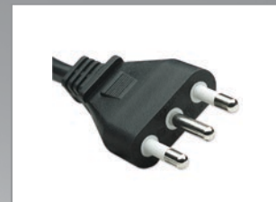
Italian Plug 2P+T 16A