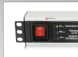
On/off lighting switch